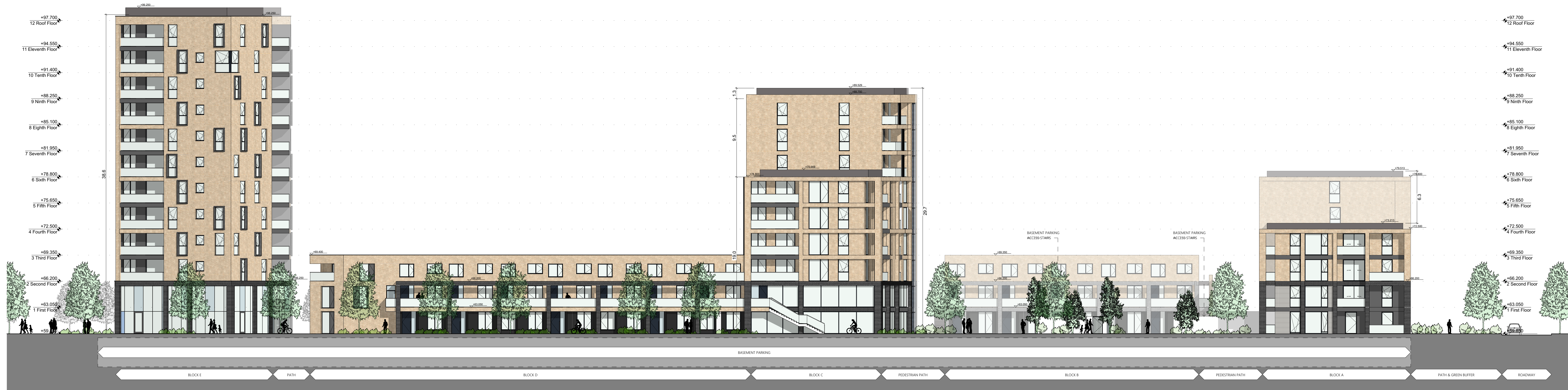
NORTH ELEVATION SCALE 1:200