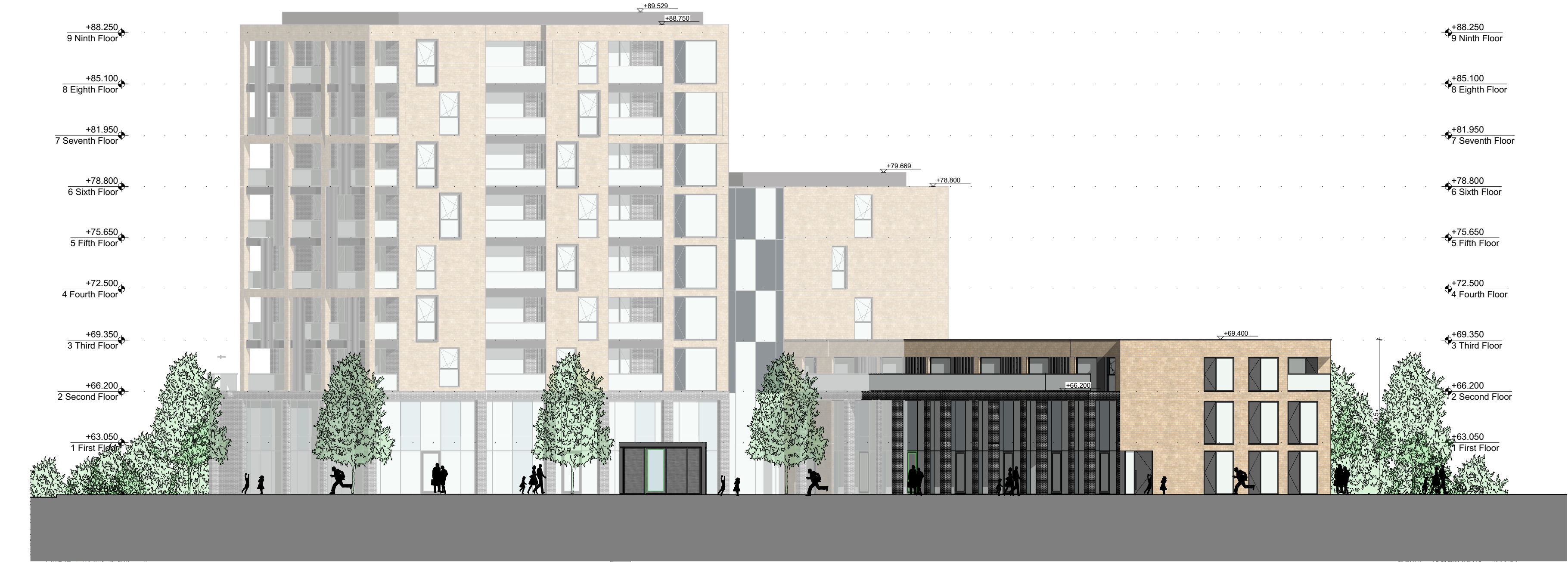
EAST 1 ELEVATION SCALE 1:200