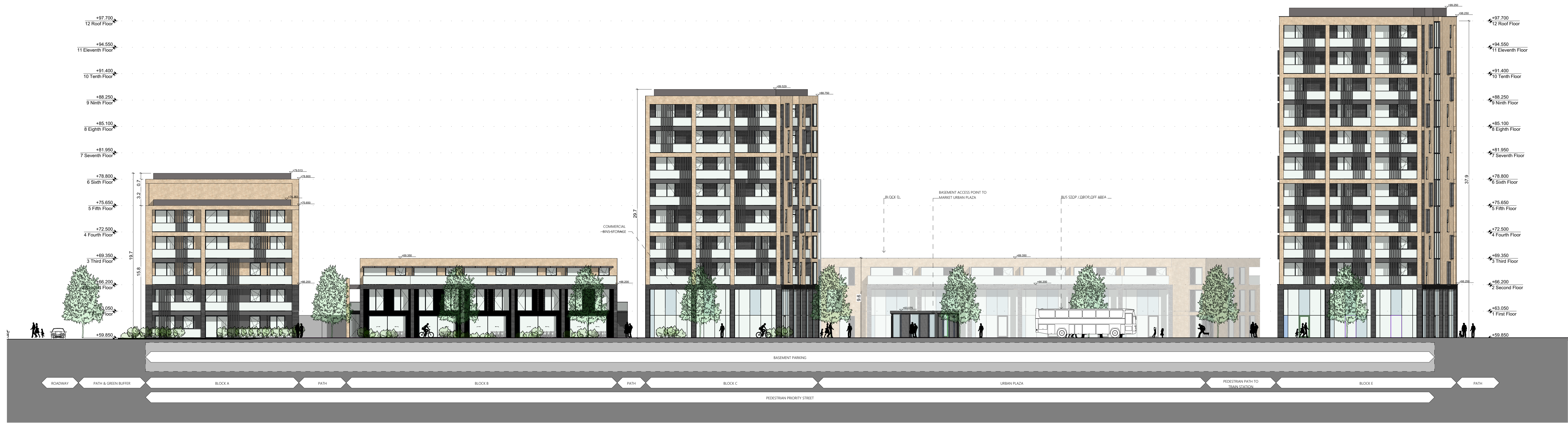
SOUTH ELEVATION SCALE 1:200